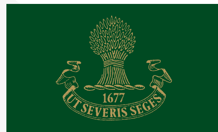
Sandbach Foundation School