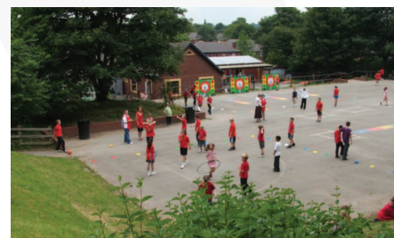
Park View Primary School, Prestwich